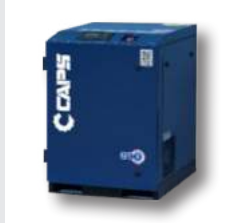
HIGH PRESS. RECIPS.