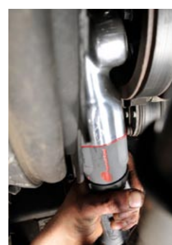
Crankshaft balancer bolt (with radiator stil

A head height of under 2" and reactionless torque allow you to safely use this powerful tool in tight spaces.