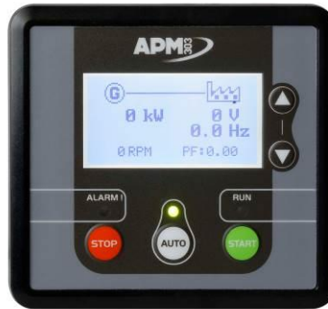
APM303 – Digital control panel