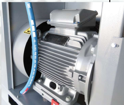
Energy saving MEPS compliant WEG IP55 motor