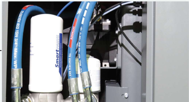
Easily accessible service components. CAPS service team can provide you with a tailored service program that keeps you focused on your business, not your air supply.