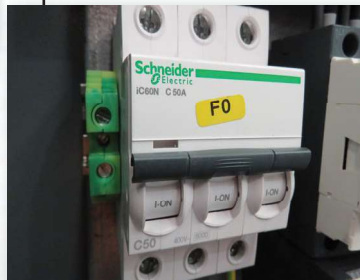
High quality Schneider switch gear.