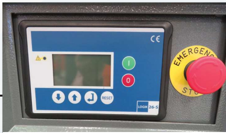
Easy to operate electronic controller