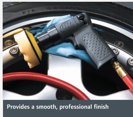
Provides a smooth, professional finish