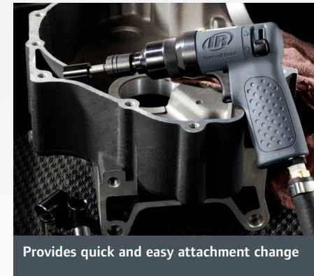
Provides quick and easy attachment change