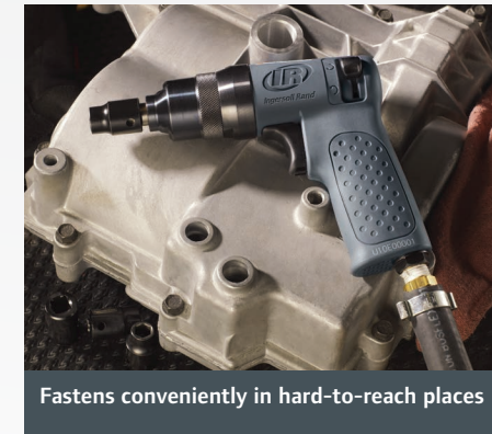
Fastens conveniently in hard-to-reach places