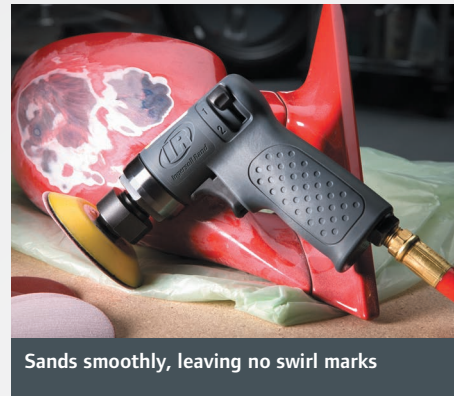
Sands smoothly, leaving no swirl marks

▶ Complete accessory package included in every kit