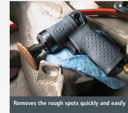
Removes the rough spots quickly and easily