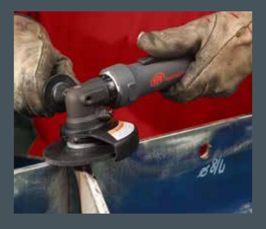
Metal and pipe cutting